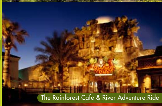
The Rainforest Cafe & River Adventure Ride