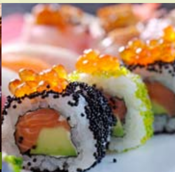
H2o Signature Sushi al fresco