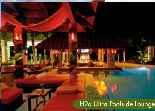
H2o Ultra Poolside Lounge