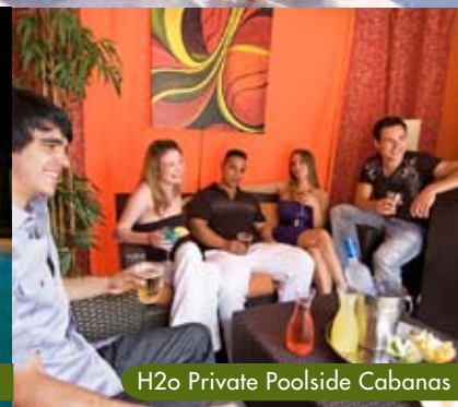
H2o Private Poolside Cabanas