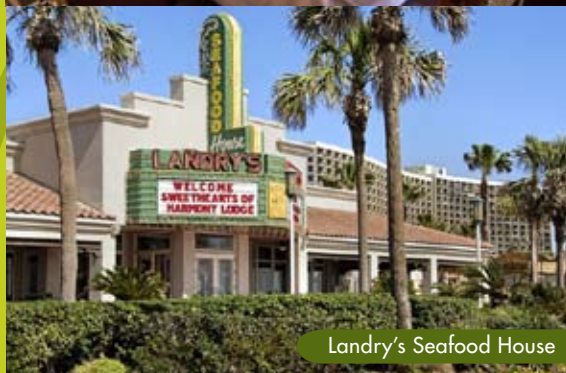
Landry's Seafood House