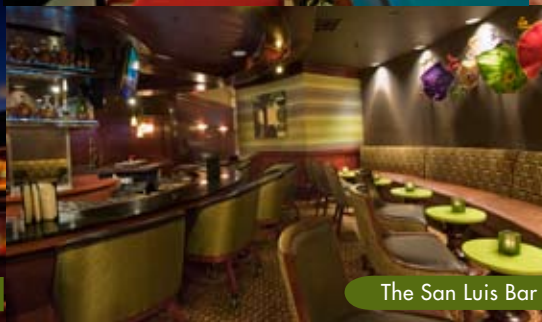
The San Luis Bar