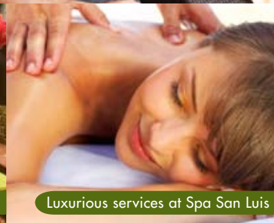
Luxurious services at Spa San Luis